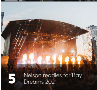
5 Nelson readies for Bay Dreams 2021