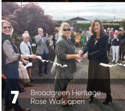
7 Broadgreen Heritage Rose Walk open