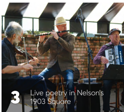
3 Live poetry in Nelson's 1903 Square

For more Christmas and Summer Event details go to pages 4 and 5.