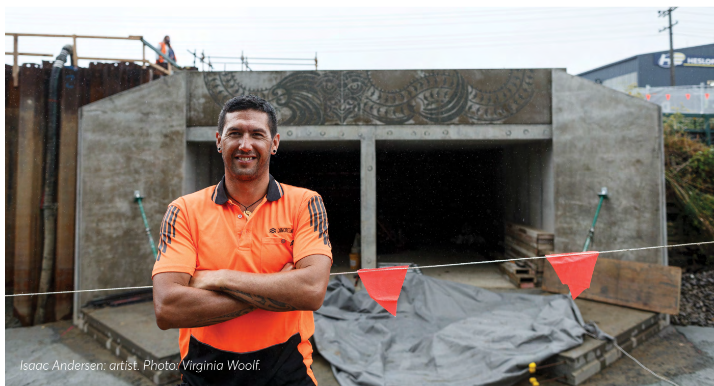
Isaac Andersen: artist.

With extreme weather events more likely to occur due to climate change, the Saxton Creek Upgrade is one of a number of infrastructure projects Council is working on to increase Nelson's stormwater capacity and resilience to heavy rainfall.