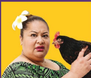
STILL LIFE WITH CHICKENS Suter Theatre Sat 26 & Sun 27 Oct, 7pm