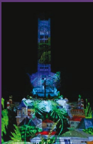
PIC'S PIKI MAI Upper Trafalgar Street, Fri 18 – Mon 28 Oct, dusk to midnight