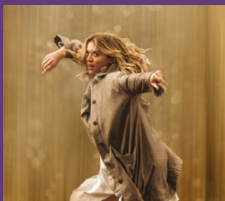
THE CLEARING Theatre Royal Sat 19 Oct, 8pm