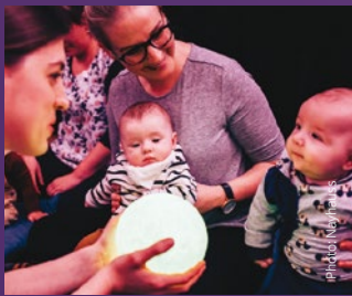
UP AND AWAY Make/Shift Space, Nelson CBD, Sun 20 Oct, 10am, 11am, 1pm, 2pm