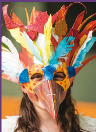
MASK PARADE & CARNIVALE Upper Trafalgar & Hardy Streets, Fri 18 Oct, 5.30pm (Parade), 6.30 – 10pm (Carnivale)