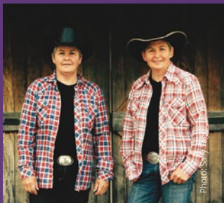
THE TOPP TWINS Theatre Royal, Sun 27 Oct, 7pm & Mon 28 Oct, 3pm