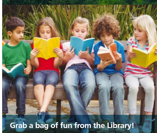
Grab a bag of fun from the Library!