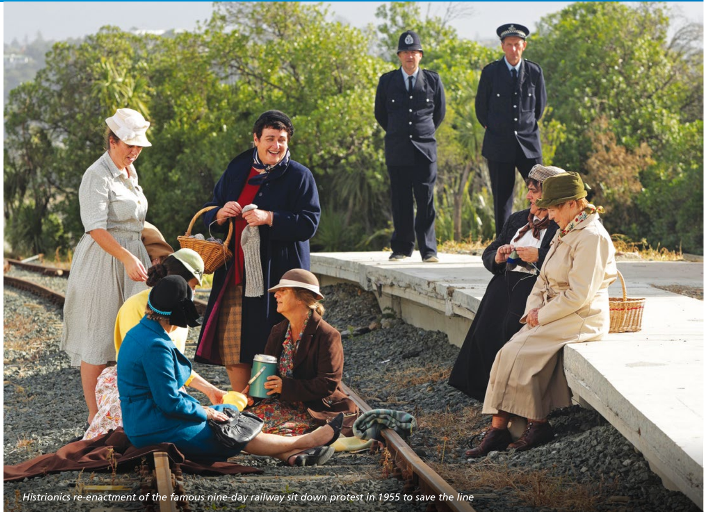
Histrionics re-enactment of the famous nine-day railway sit down protest in 1955 to save the line