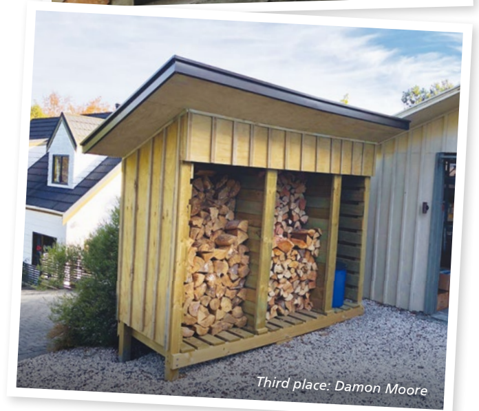
Third place: Damon Moore