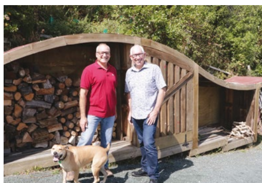
Best Little Woodshed winners

See the next edition of Our Nelson for the programme or see nelson.govt.nz/heritage-festival for more information.