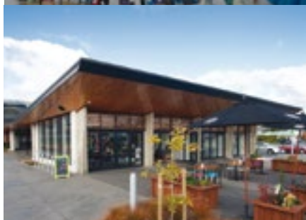
3 Greenmeadows Community Open Day