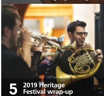
5 2019 Heritage Festival wrap-up