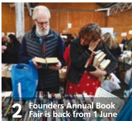
2 Founders Annual Book Fair is back from 1 June

"By making the declaration, Council is committed to looking at how its plans, policies, and work programmes can support action to address the climate emergency, and ensuring that a climate emergency strategy is embedded in all future Council strategic plans."