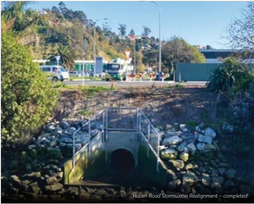
Haven Road Stormwater Realignment – completed!