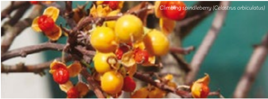
Climbing spindleberry ( Celastrus orbiculatus )