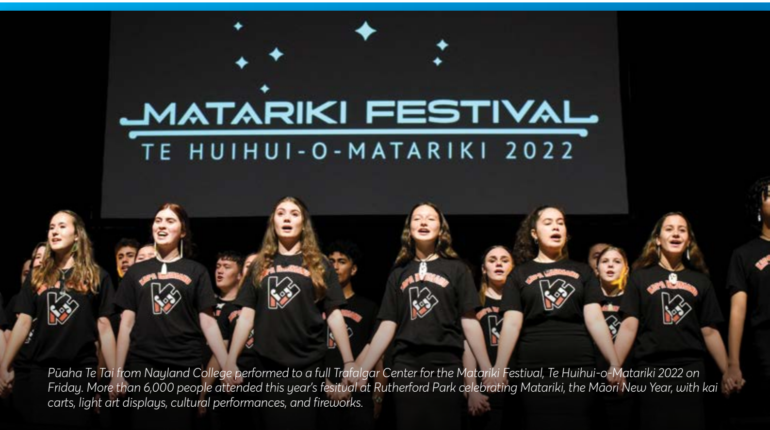
Pūaha Te Tai from Nayland College performed to a full Trafalgar Center for the Matariki Festival, Te Huihui-o-Matariki 2022 on Friday. More than 6,000 people attended this year's festival at Rutherford Park celebrating Matariki, the Māori New Year, with kai carts, light art displays, cultural performances, and fireworks.