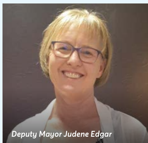
Deputy Mayor Judene Edgar

All the matters being discussed in these engagement processes are important in shaping the future of our city. We value and appreciate the time and effort our residents put into our engagement processes. The more input we have the better off we will all be.