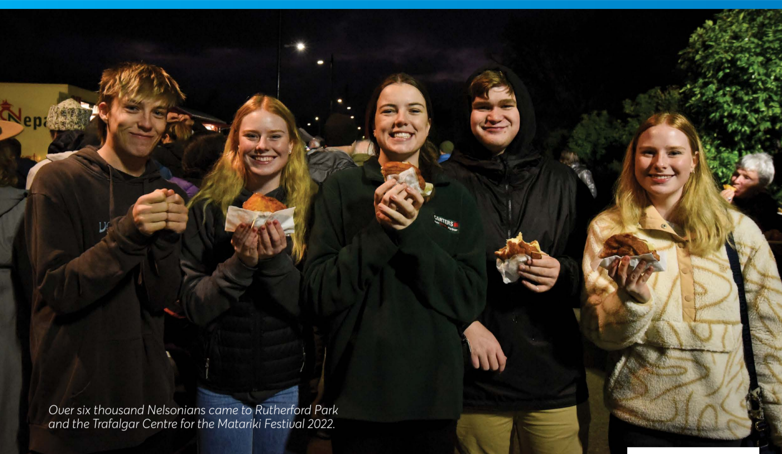
Over six thousand Nelsonians came to Rutherford Park and the Trafalgar Centre for the Matariki Festival 2022.

Keep up to date with the latest news from Nelson City Council