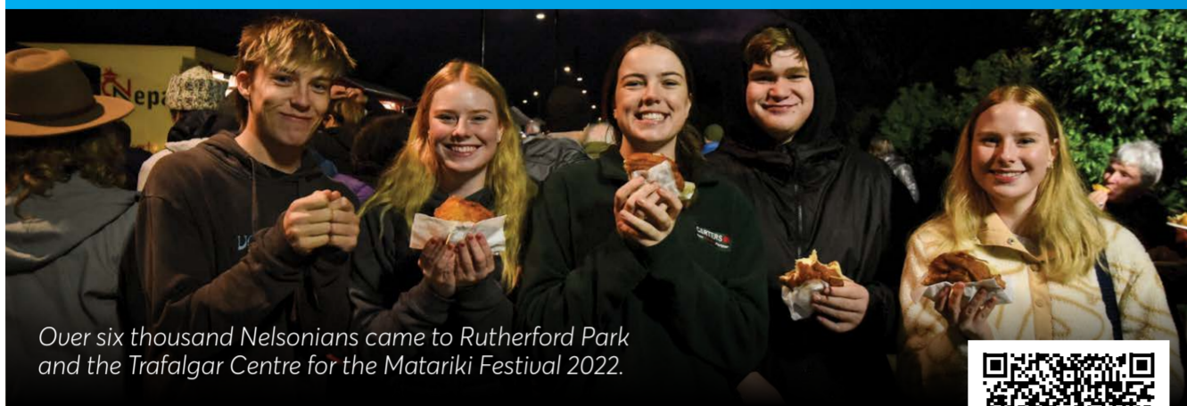
Over six thousand Nelsonians came to Rutherford Park and the Trafalgar Centre for the Matariki Festival 2022.