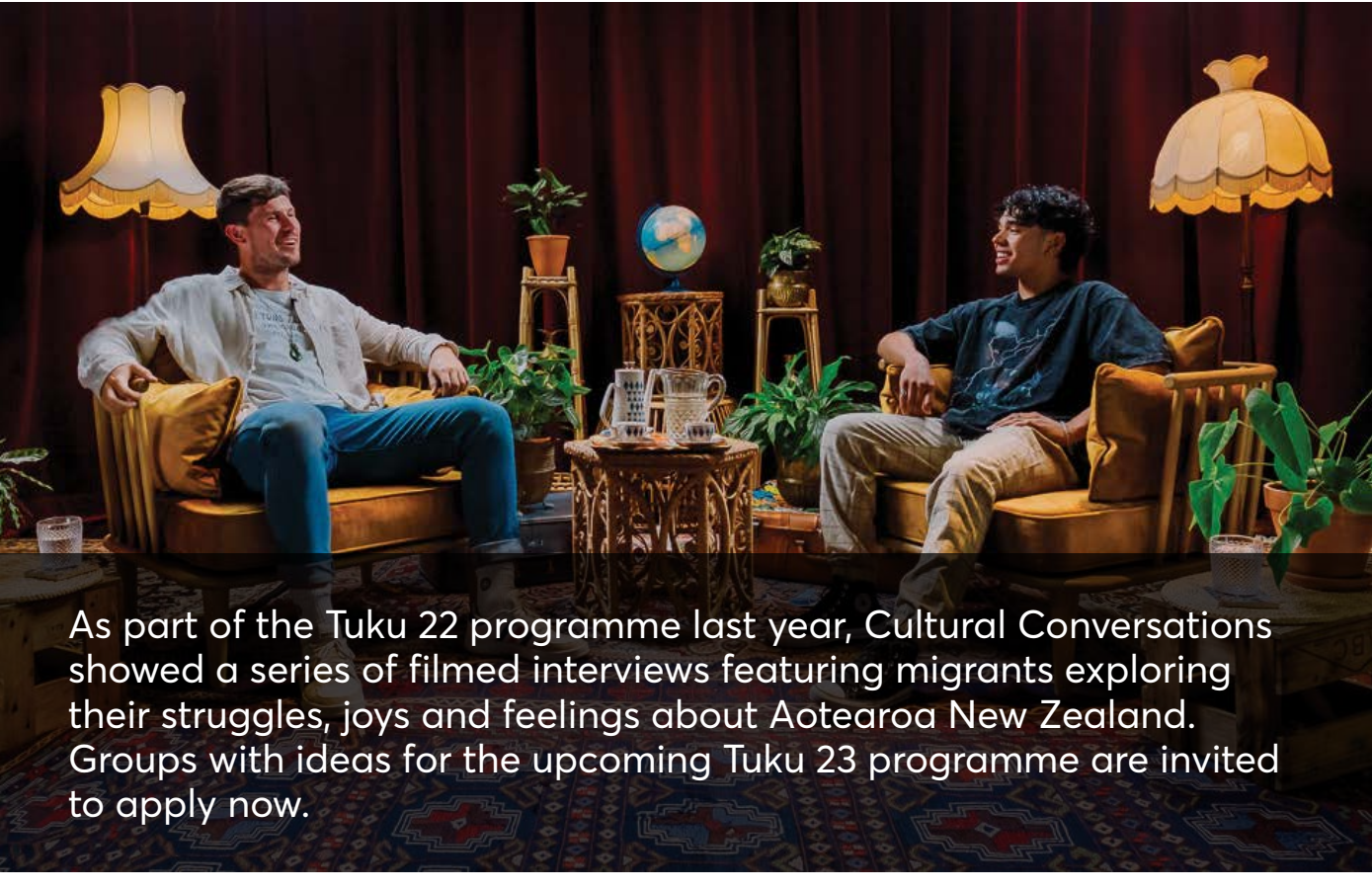
As part of the Tuku 22 programme last year, Cultural Conversations showed a series of filmed interviews featuring migrants exploring their struggles, joys and feelings about Aotearoa New Zealand. Groups with ideas for the upcoming Tuku 23 programme are invited to apply now.