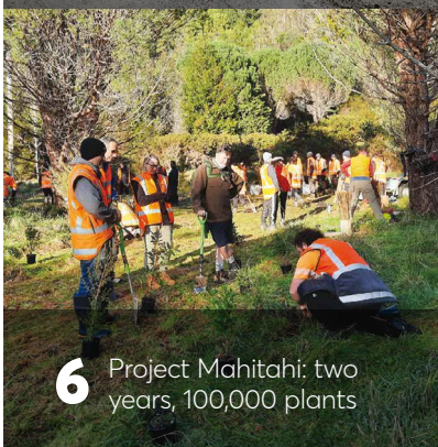
6 Project Mahitahi: two years, 100,000 plants