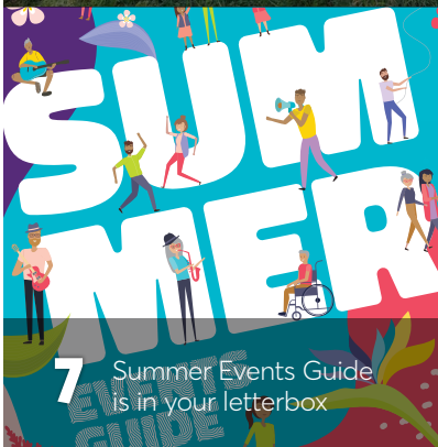
7 Summer Events Guide is in your letterbox