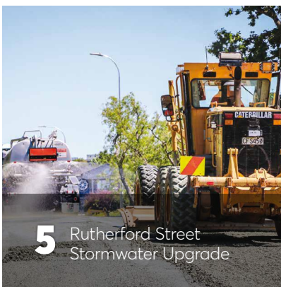
5 Rutherford Street Stormwater Upgrade