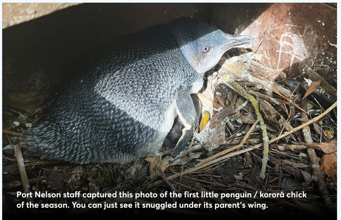
Port Nelson staff captured this photo of the first little penguin / kororā chick of the season. You can just see it snuggled under its parent's wing.