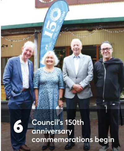
6 Council's 150th anniversary commemorations begin