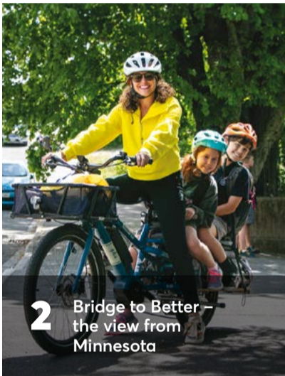
2 Bridge to Better – the view from Minnesota

Keep up to date with the latest news from Nelson City Council