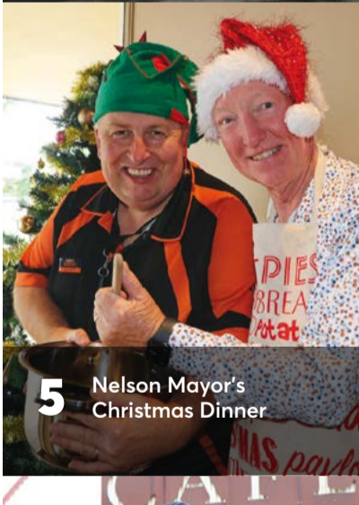
5 Nelson Mayor's Christmas Dinner