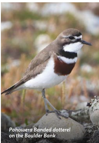
Pohowera Banded dotterel on the Boulder Bank