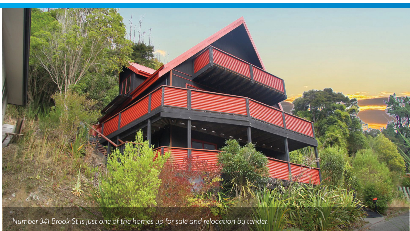
Number 341 Brook St is just one of the homes up for sale and relocation by tender.