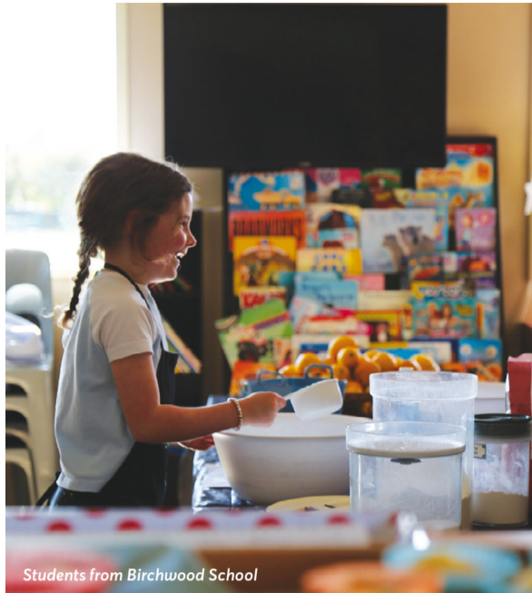
Students from Birchwood School